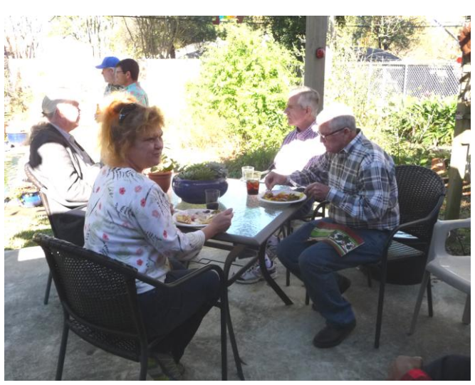
Page 6 of 6